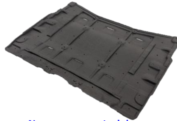
Non-woven material Weight per unit area : 1200g/m 2