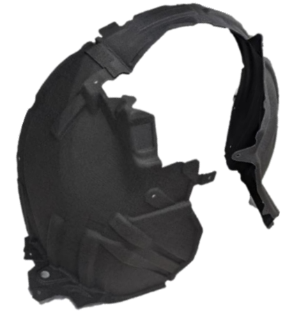
Non-woven material Weight per unit area : 950g/m 2