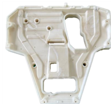
Engine under cover